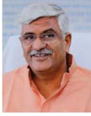
गजेंद्र सिंह शेखावत Gajendra Singh Shekhawat